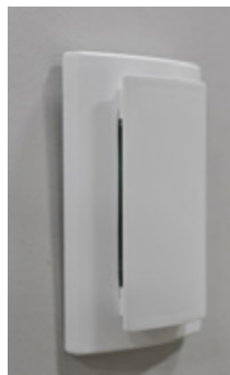
Remote sensor allows for control panel placement outside of temperature-controlled room