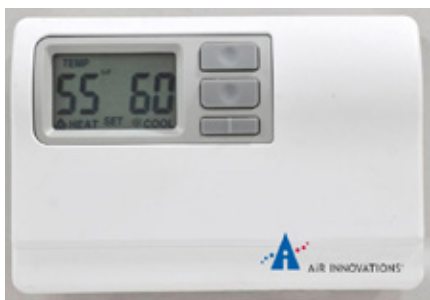
Wall mount controls for temperature and humidity